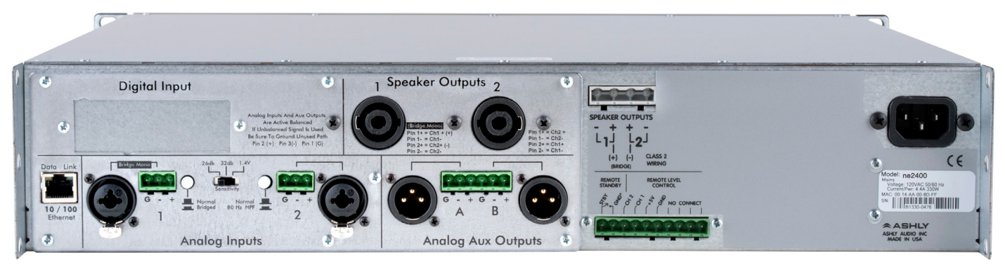
ne2400 Rear Panel