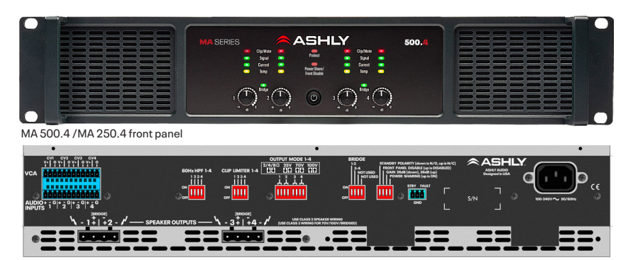
MA 500.4 /MA 250.4 back panel