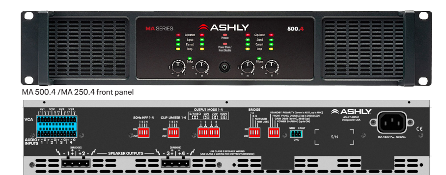
MA 500.4 /MA 250.4 back panel